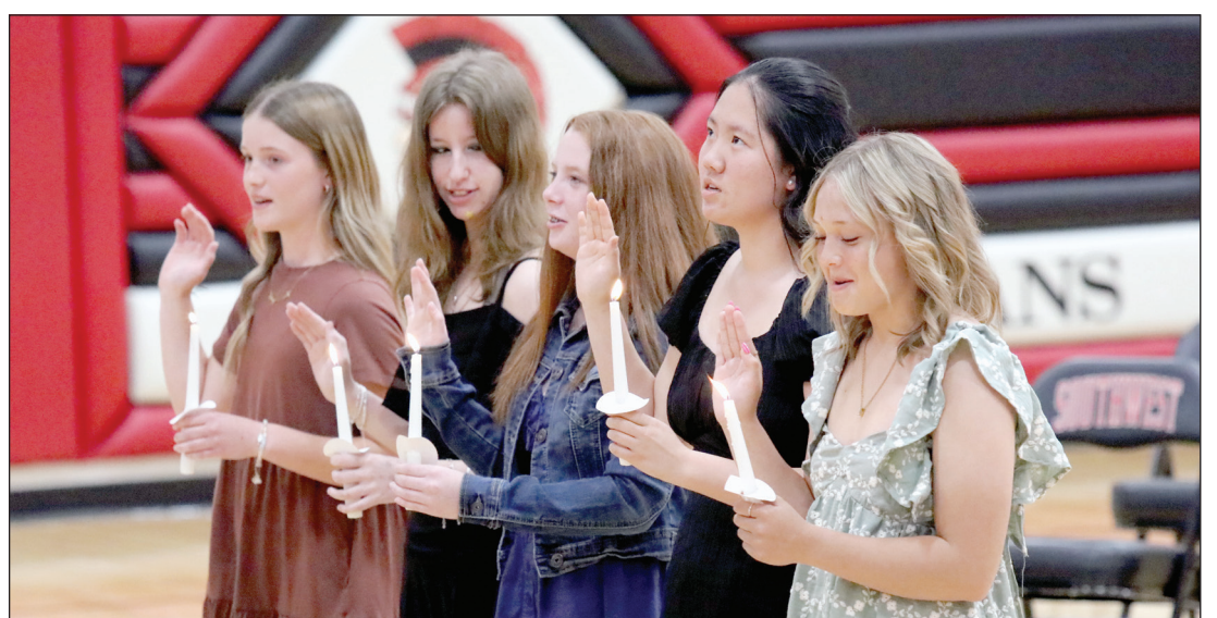
Five new members of the Southwest Chapter of the National Honor Society take their oaths on April 1.