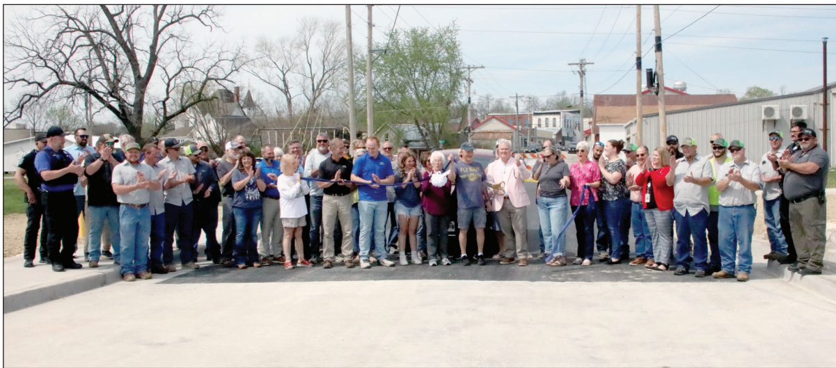
A hefty turnout participated in the ribbon cutting for the new 7th Street Bridge into the Cassville City Park on March 31.