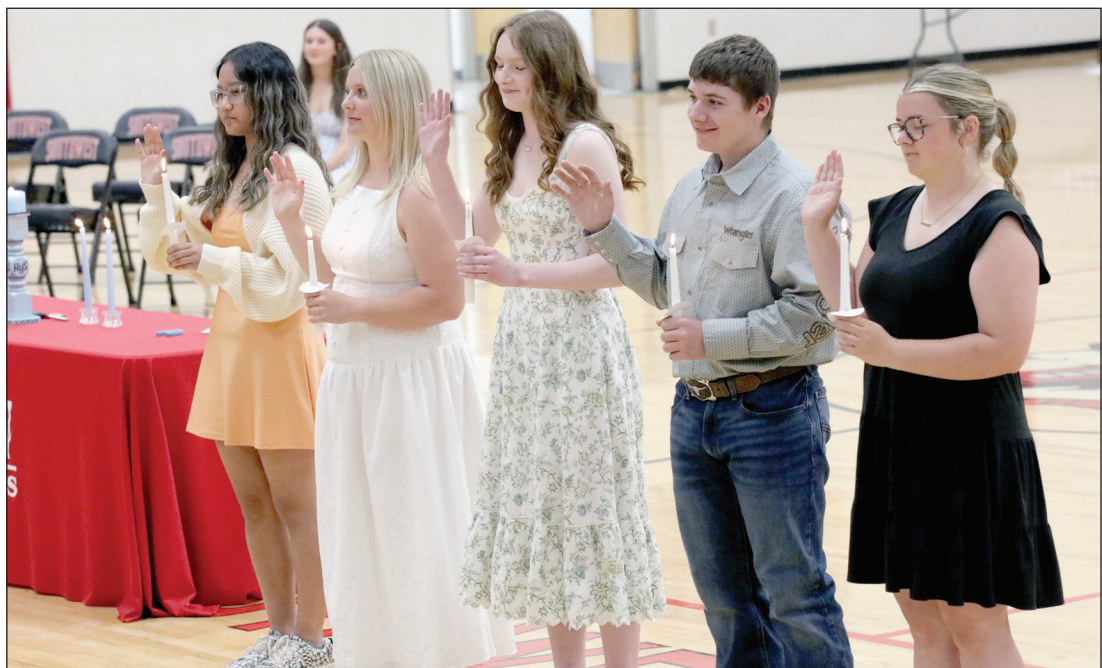
Five new members of the Southwest Chapter of the National Honor Society take their oaths on April 1.