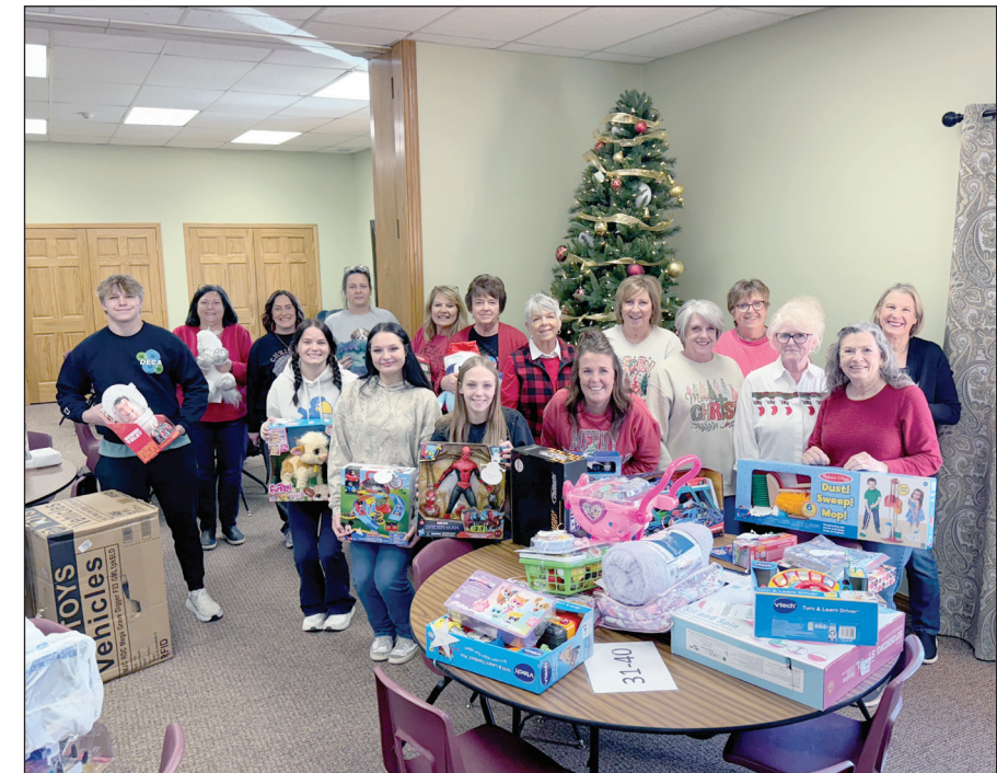
Share Your Christmas has provided toys to children at Christmas time in Barry County for over 45 years. This year, the organization is providing gifts to nearly 400 children. The organization is fully funded by community support, including fundraising efforts by the CHS Merry Christmas candidates, local businesses, corporations and clubs adopting families as well as community support by purchasing gifts from the Share Your Christmas trees found around town.