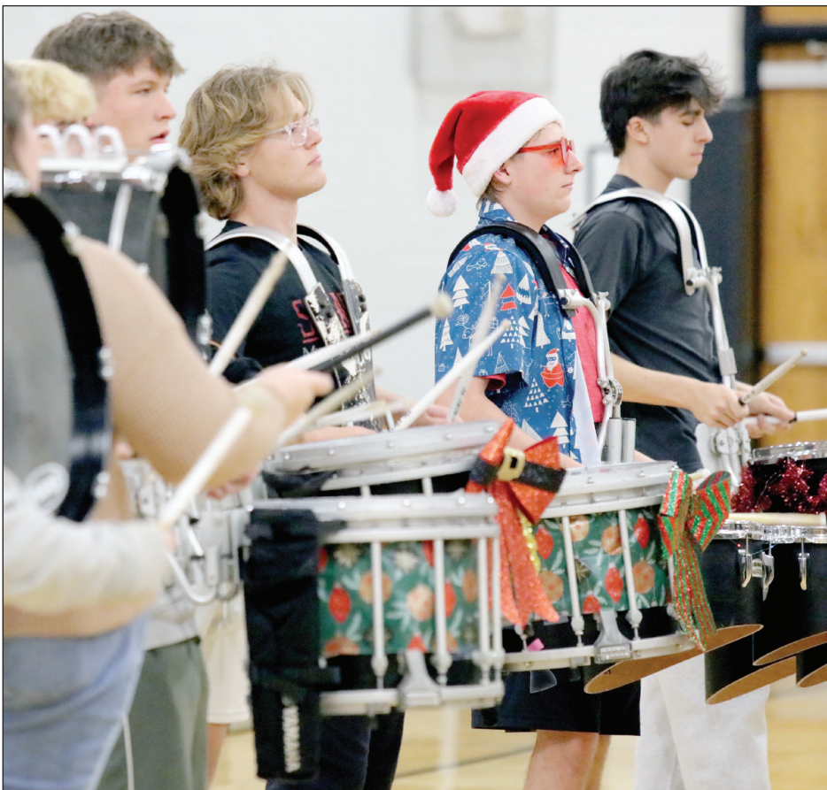
The Cassville Wildcat Pride drum line performs at the Cassville High School Christmas pep rally on Friday.