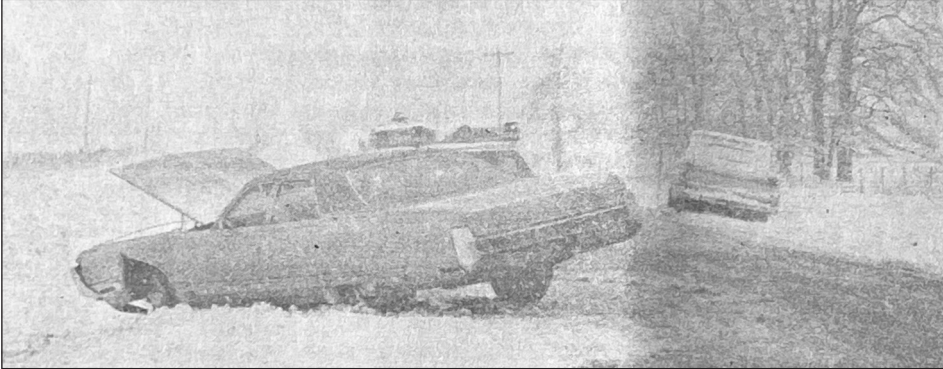
50 YEARS AGO: HAZARDOUS TRAVEL — Christmas morning slick roads caused a two-car accident near Exeter injuring four people. The day after Christmas.

Meet the adorable Buster! He is a dachshund/terrier mix breed, and he is a low rider! His DOB is 12/20/2024 and he weighs 40 pounds. He gets along with other dogs and loves people. Our $30 adoption special on all pets runs through the end of the year. Adopters can complete an application at www.havenoftheozarks.org/adopt. No appointment is needed. The Haven is open from 9 a.m. to 4 p.m., seven days a week. All Haven of the Ozarks pets are fixed, up to date on their vaccinations, and microchipped. For more information, people may email havenozarksanctuary@gmail.com, or call at 417-835-3647.