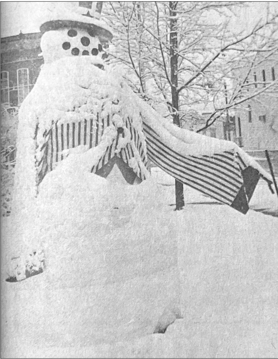
50 YEARS AGO: INTO THE REAL THING — A junior high art department snowman created for a Christmas parade later became an authentic snow figure on the courthouse lawn.