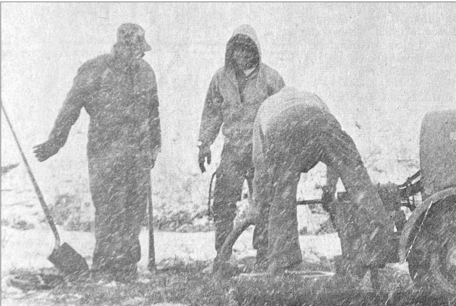
50 YEARS AGO: Sewer problems during a blizzard did not stop city crews from performing their duties.